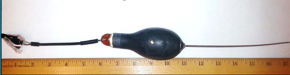
Electronic PSAT Tag